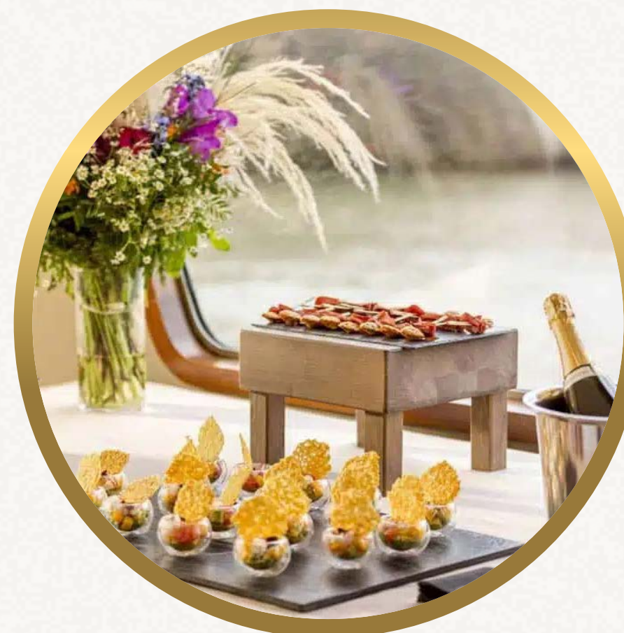
Cocktail dinner organised on Seine river cruise