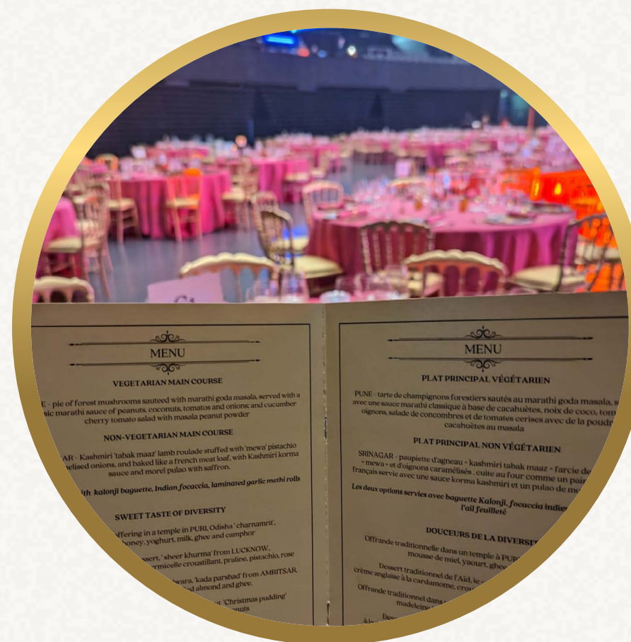
Gala dinner for 600 guests at the famous Seine Musicale