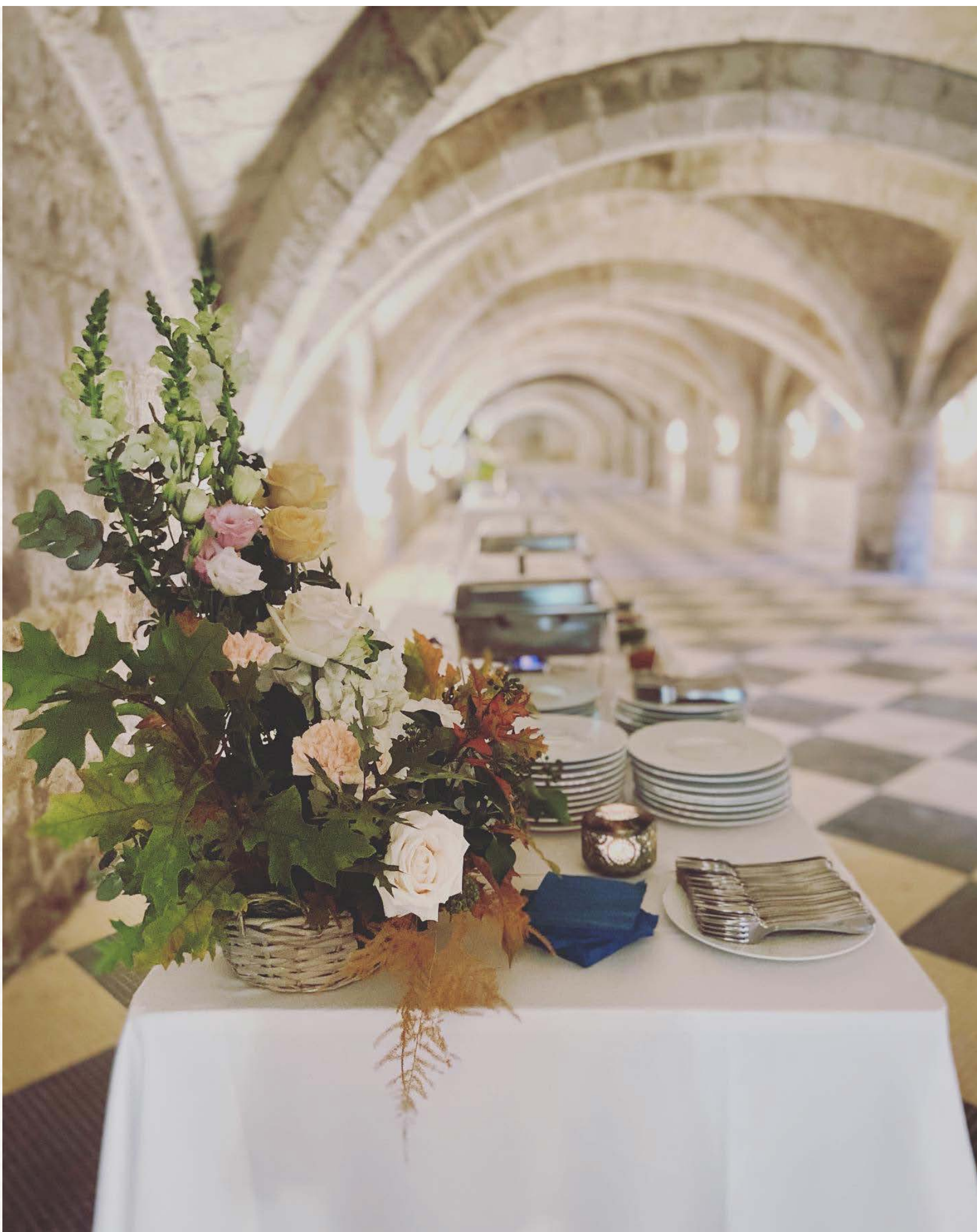
Private event with a custom vegan menu Abbaye Royale du Moncel