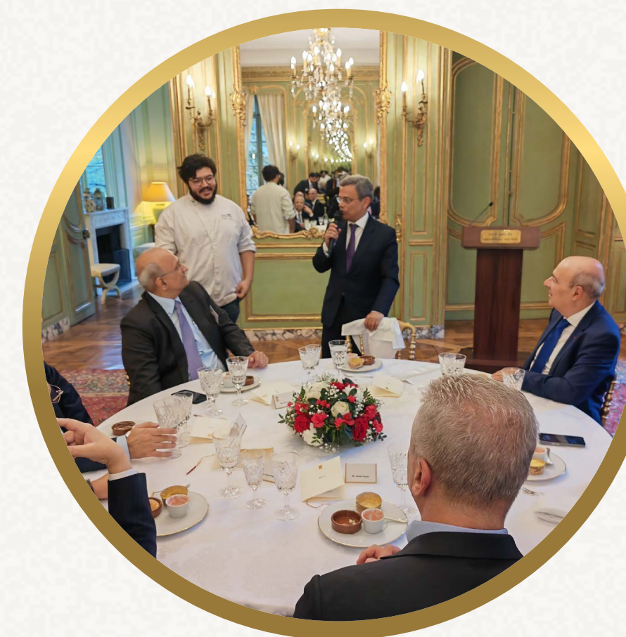
Indo-French CEO meet at The Indian Embassy in Paris