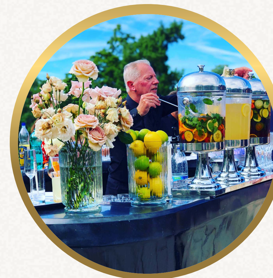
A destination wedding in Vendée-France